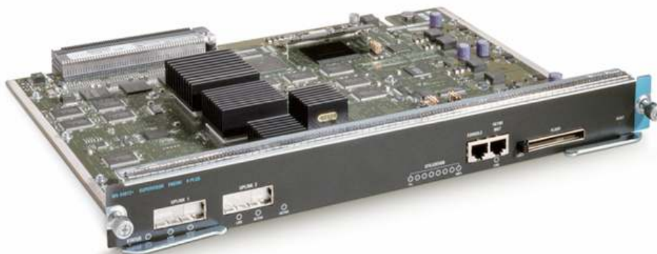
Figure 1. Cisco Catalyst 4500 Series Supervisor Engine V

The Cisco Catalyst 4500 Series integrates security and resiliency for advanced control of converged networks.